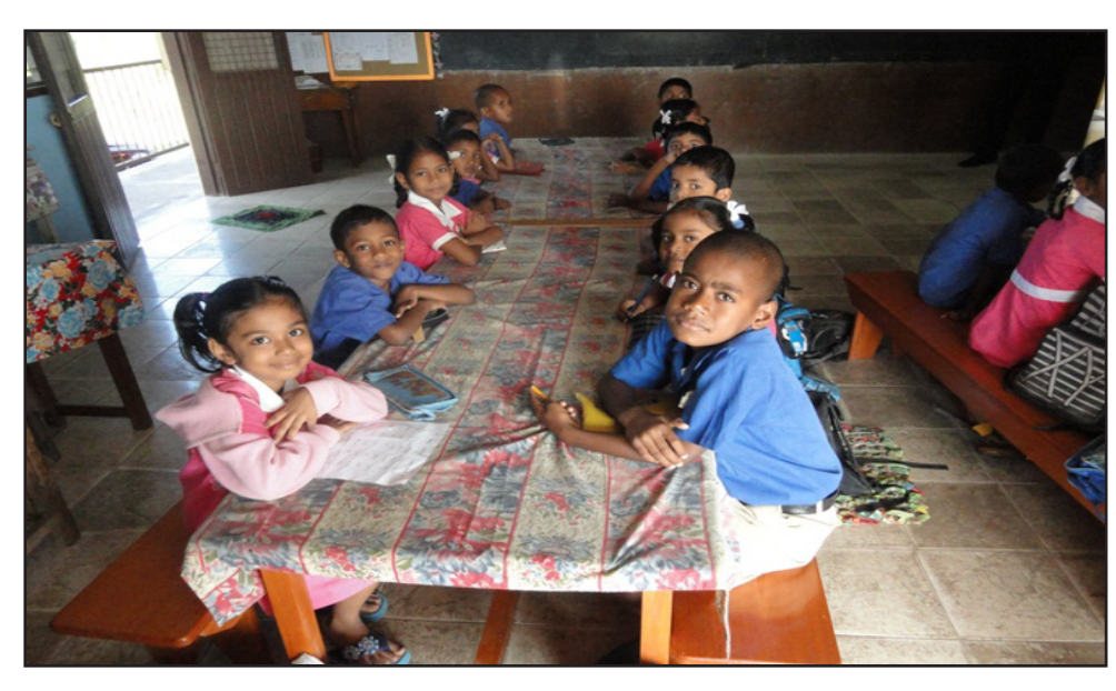
Children of Class 1, Gurukul School, Lautoka were smiling brightly as they received new desks from the NZ High Commission and some books from the Fiji Association in Auckland