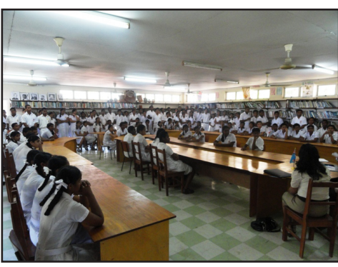
Tavua College seniors applaud winner