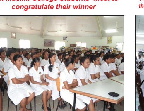
SVC Nadi applaud winner